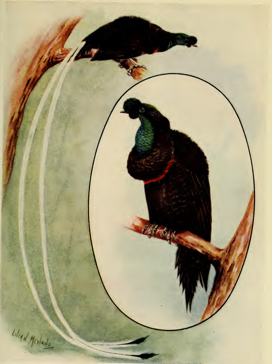
Taeniapardisea macnicolli Kinghorn.